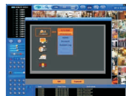
Remote DVR Control