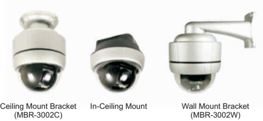
Ceiling Mount Bracket (MBR-3002C)