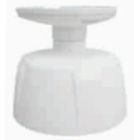
Ceiling Mount Bracket (MBR-3001C)