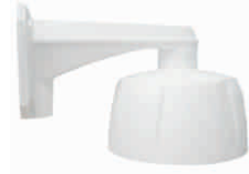
Wall Mount Bracket (MBR-3001W)