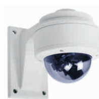
Wall Mount Bracket (MBR-401WM)