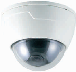
TDC-32327QSD5 Surface Mount Type