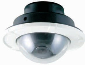
TDC-32327QFD5 Flush Mount Type