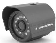
Camera / Sunshield