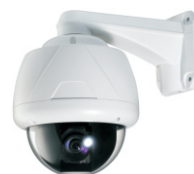
Wall Mount Bracket (TDX-N37WW, TDX-P37WW)