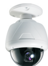
Ceiling Mount Bracket (TDX-N37WC, TDX-P37WC)