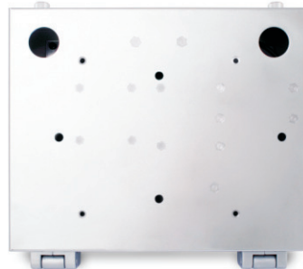
- REAR -