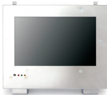
- FRONT -