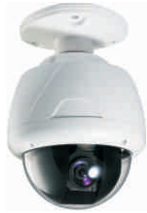
Ceiling Mount Bracket (TDX-N27C, TDX-P27C)