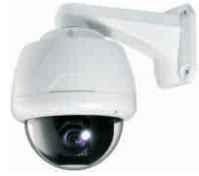
Wall Mount Bracket (TDX-N27W, TDX-P27W)